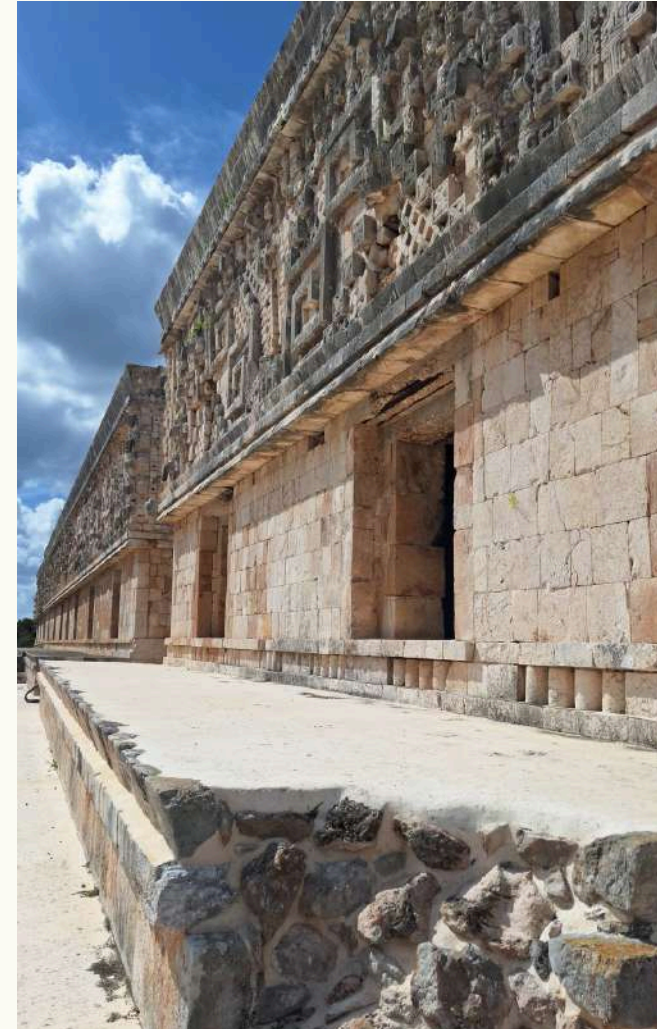
History and archaeology