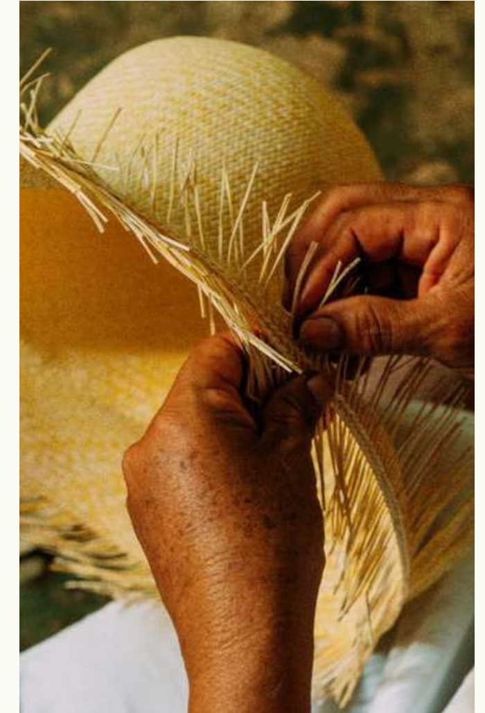
Living Traditions and Cultural Heritage