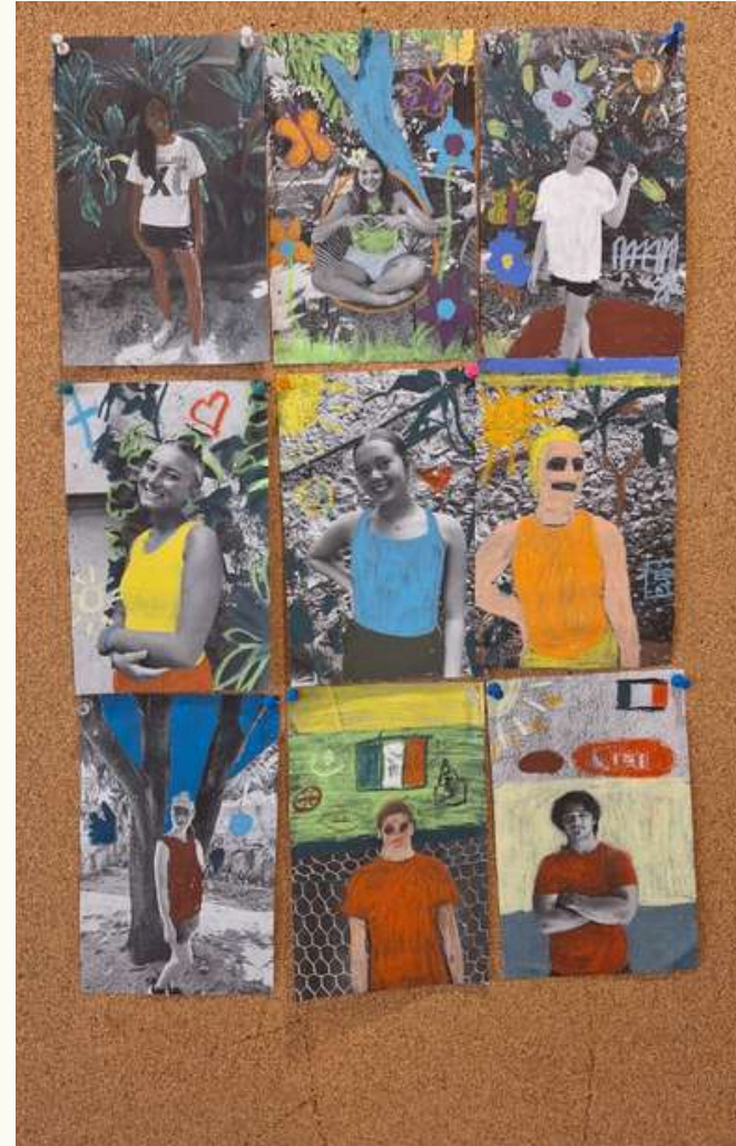
Cultural & language immersion