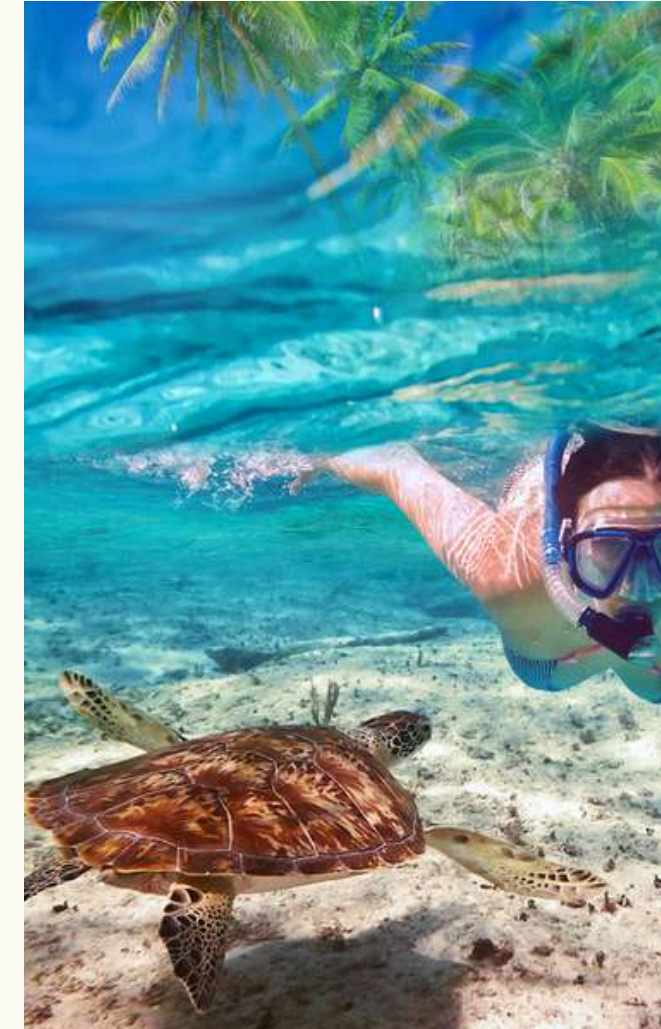
Conservation and Biodiversity