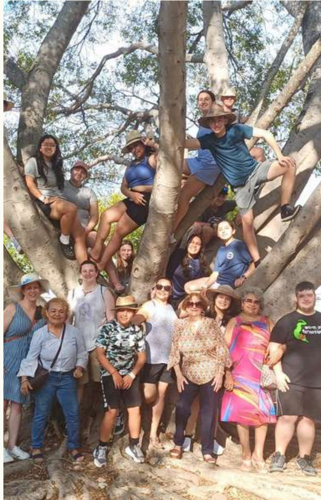
Homestay with local families